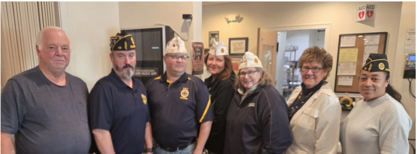
Pictured from left to right