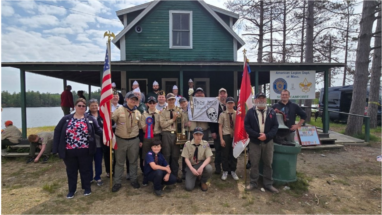
Troop 164 from Palmer won over all best troop at The American Legion Scouting Camporee over Father's Day weekend. The Troop was Sponsored by Merrill L. Simonds Post 130. Post 130 congratulates the troop for all their hard work.