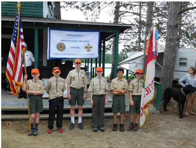
Troop 821 Sponsored by Post 124 Westfield at Camporee