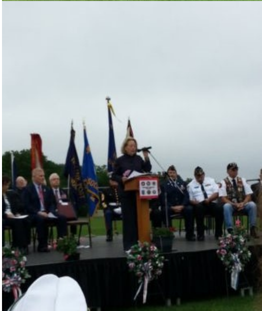
Congresswoman Nikki Tsongas