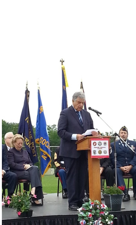
Mayor James Fiorentini